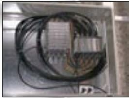
Line amplifiers feed signals in the distribution system.

Sogn Service in Oslo - Norway, is a company who runs and makes cable-TV systems, SAT-MF systems as a supplier or by themself.