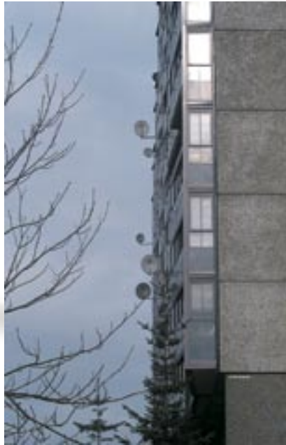
Individual dishes outside many apartments. Not a pretty sight.

Local network operator, Sogn Service, was asked whether it would be possible to provide a network service covering the residents' multitude of TV-wishes and replace all the individual installations. It required distribution of signals from 4 different satellite positions to 980 apartments - and probably the largest SAT distribution network in Norway.