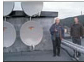
Nice and easy installation of dishes on the rooftop